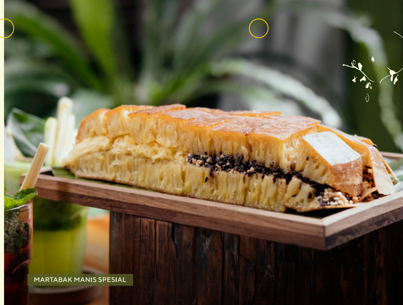
MARTABAK MANIS SPESIAL