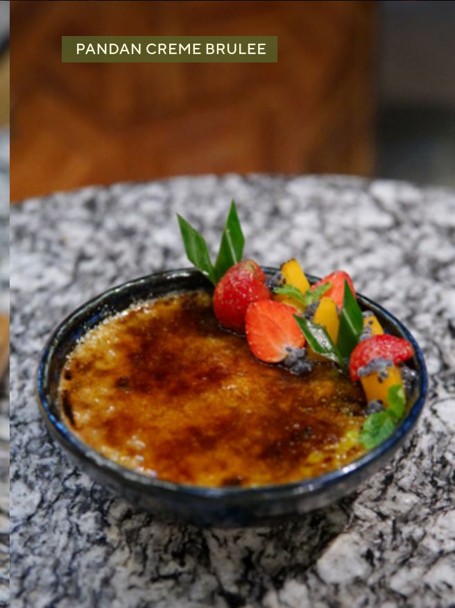
PANDAN CREME BRULEE