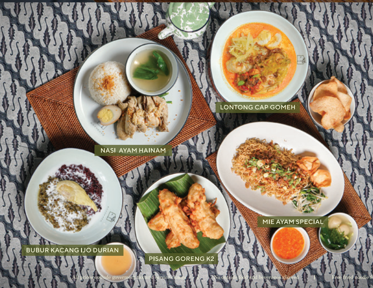
BUBUR KACANG IJO DURIAN