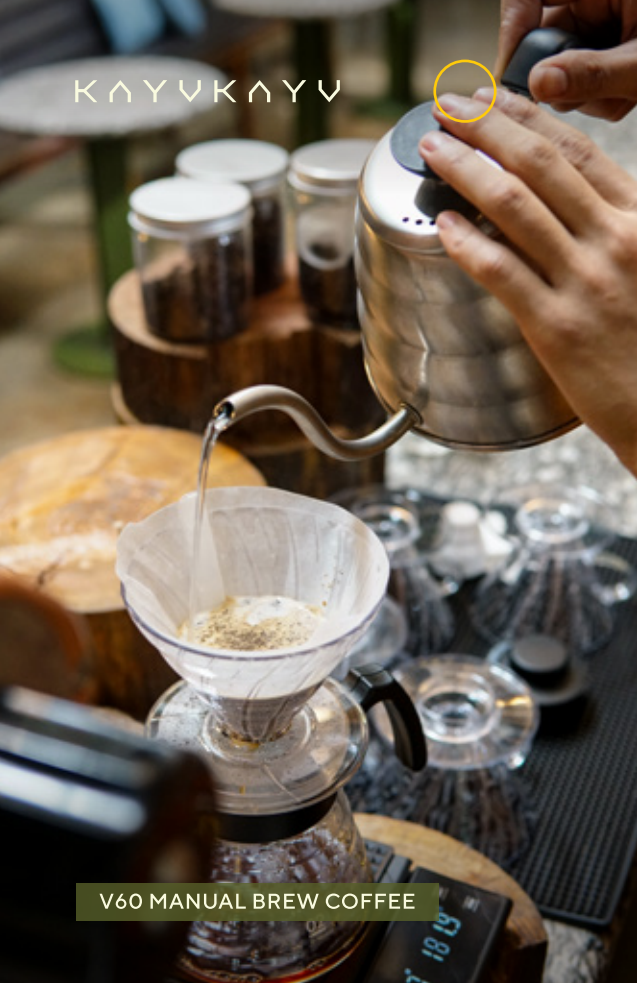
V60 MANUAL BREW COFFEE