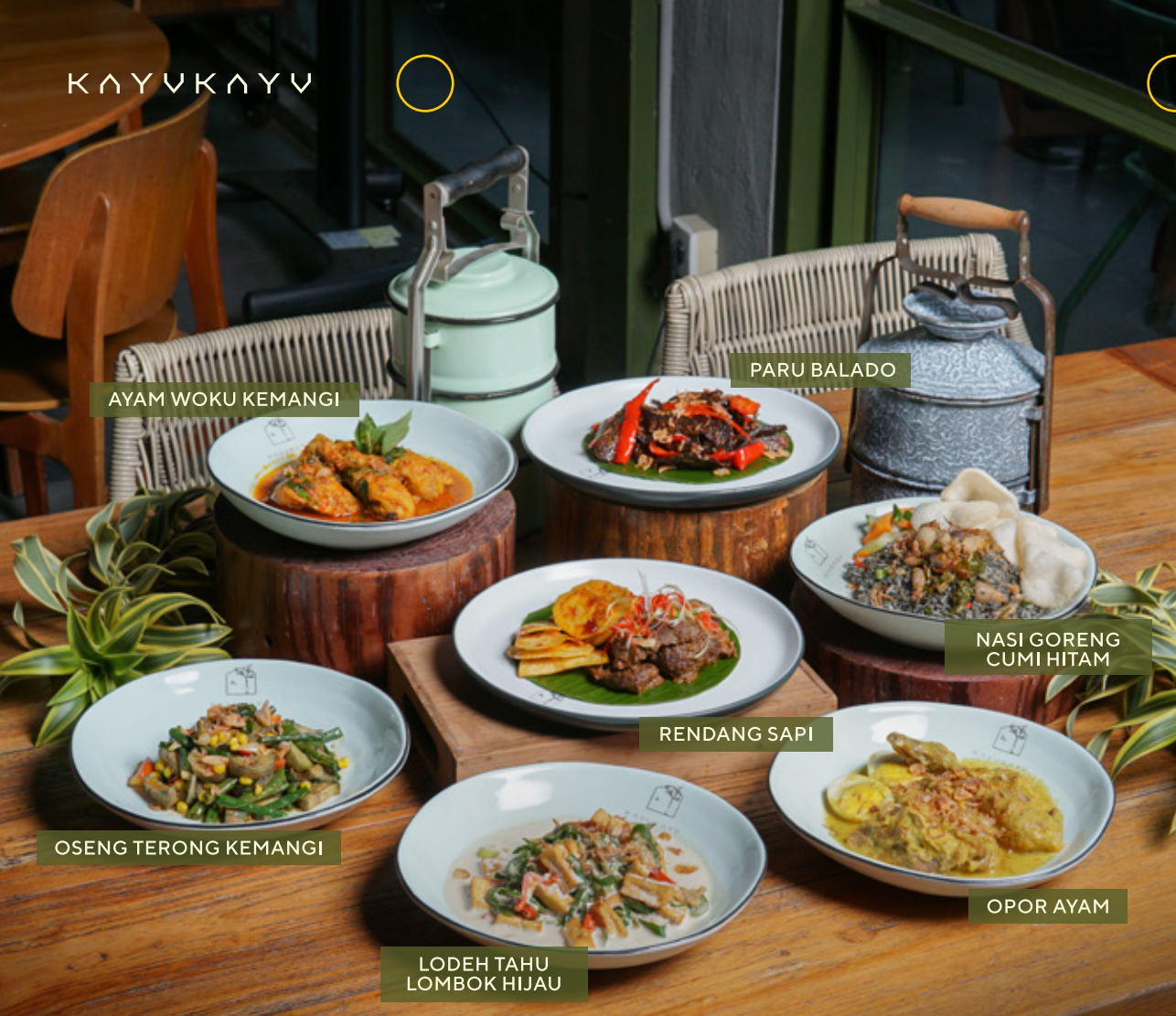
AYAM WOKU KEMANGI