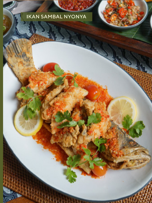
IKAN SAMBAL NYONYA