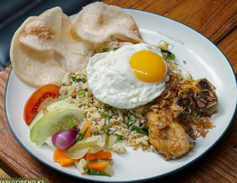
NASI GORENG K2