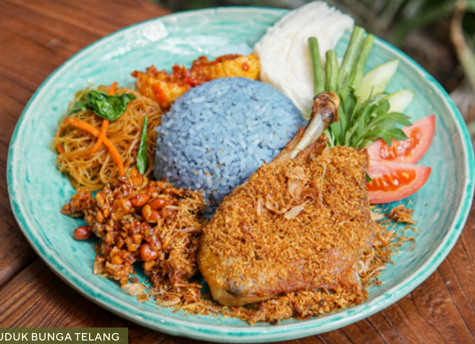
NASI UDUK BUNGA TELANG