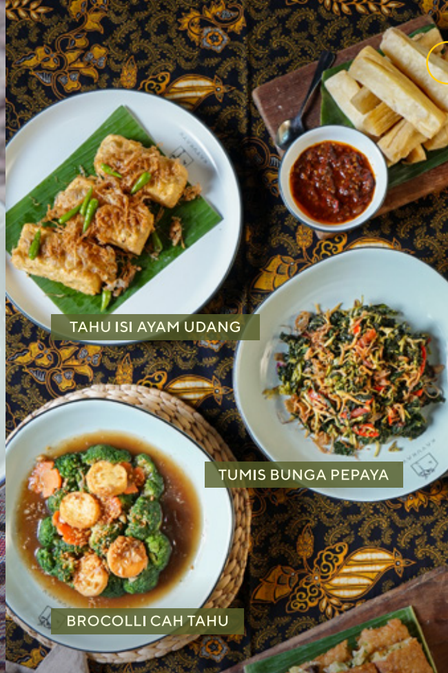
TAHU ISI AYAM UDANG