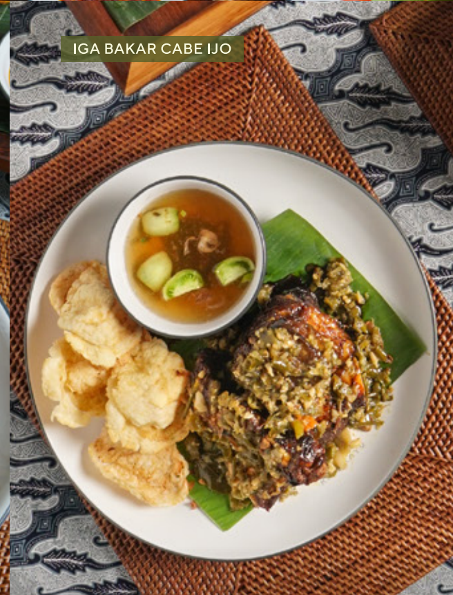
IGA BAKAR CABE IJO